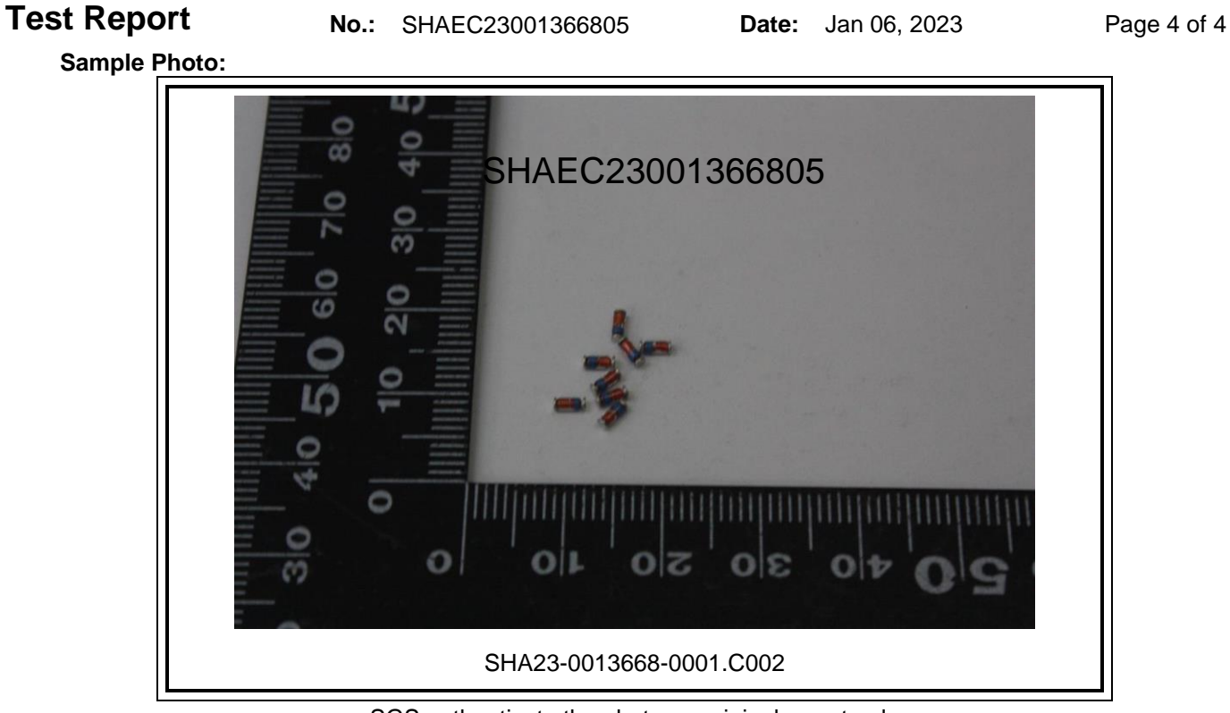
SGS authenticate the photo on original report only *** End of Report ***